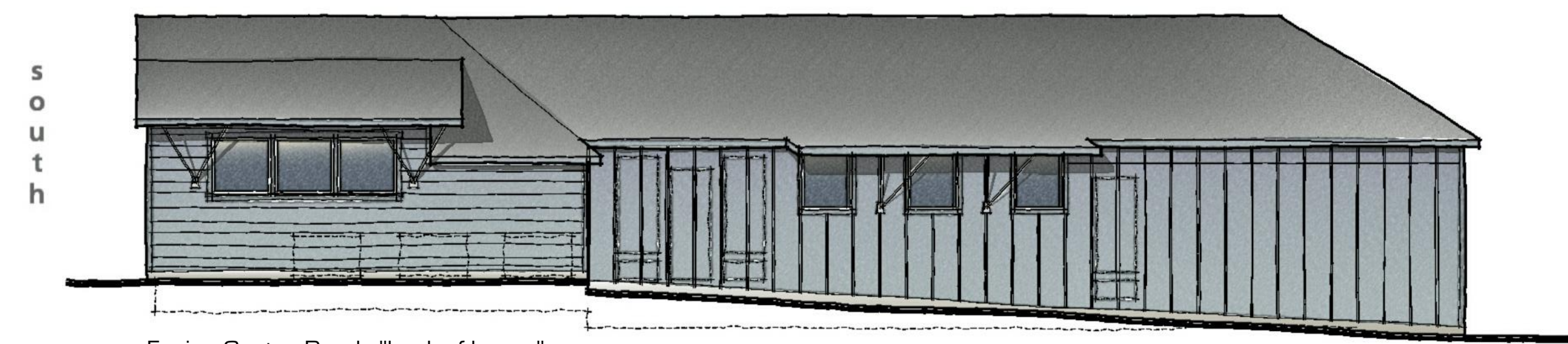
Facing Center Road - "back of house"